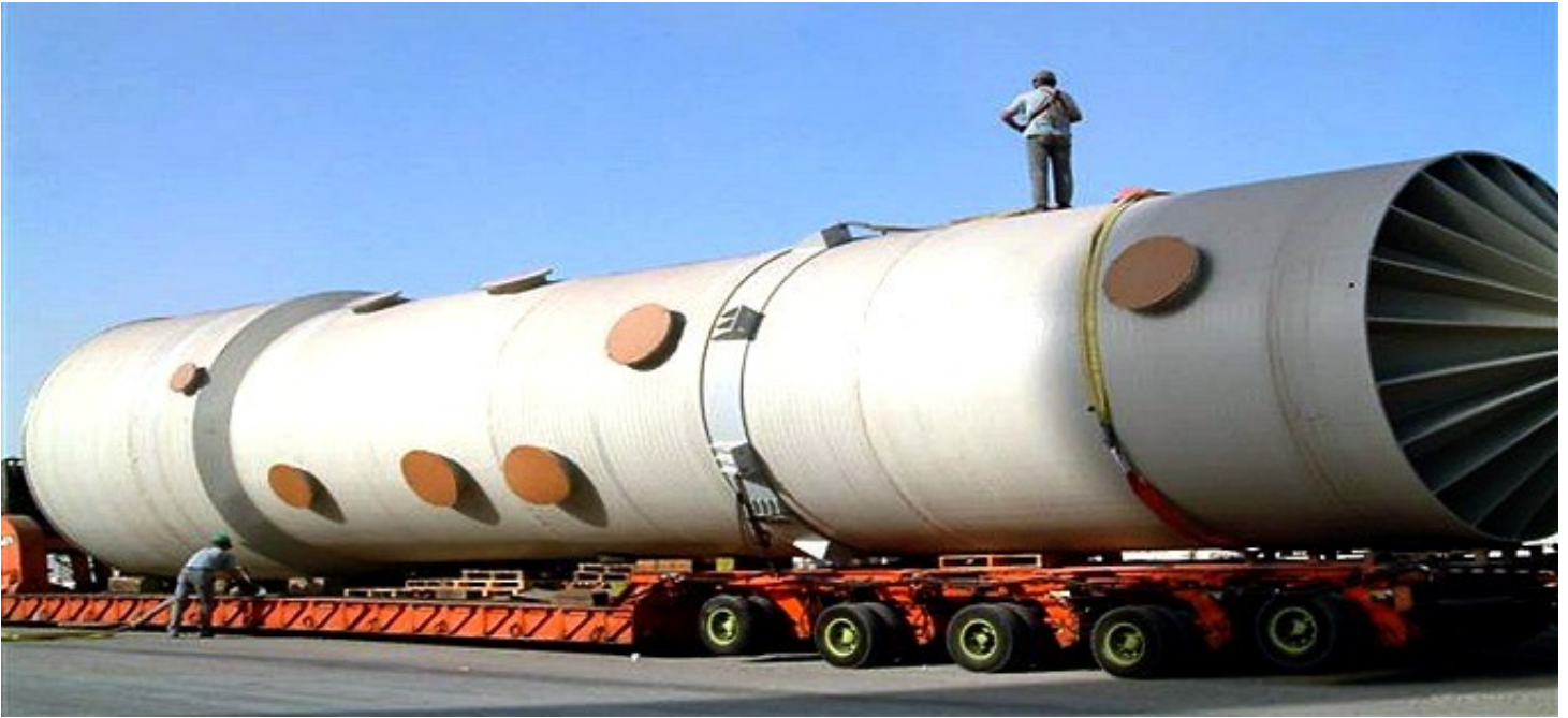
14' Diameter x 72' Tall Polypropylene Cone Bottom Cyclone