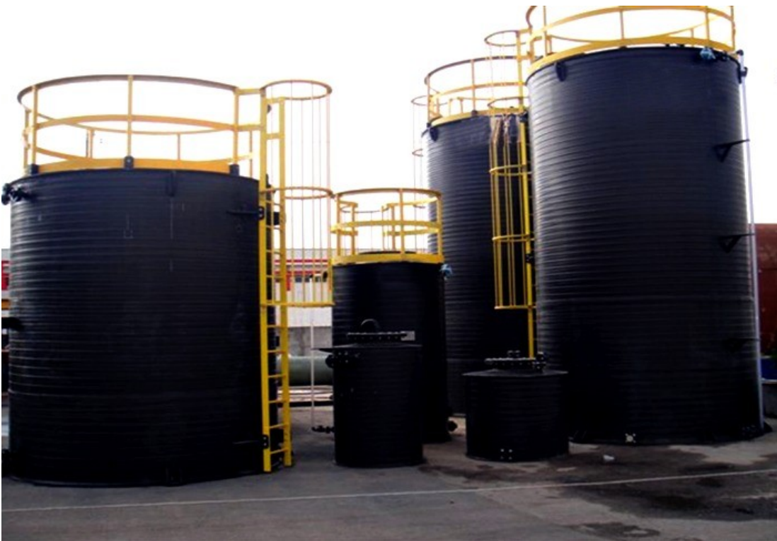
Left: Tanks shown with optional OSHA compliant ladders, safety cages, and hand rails with kick plates

Houston PolyTank designs, produces, and installs plastic storage tanks. Our tanks are produced by extruding polypropylene or polyethylene around a drum. This method emulates technology in the industry that has been proven to produce the highest quality of tanks for over 15 years. Standard poly tanks in the market today are rotationally molded and have many limitations such as wall thickness and height. This unique approach gives us the ability to design and build tanks that meet the customer's specific needs without these limitations. Our design process takes into consideration the working temperature, corrosion issues, specific gravity, and the aggressive properties of the product being stored to insure the proper tank is built for our customers. We offer tanks made with Polypropylene, Polyethylene, or Co-Poly. Tank sizes can vary from a few hundred gallons up to 50,000 gallons. Tanks can be made with flat bottoms and cone bottoms for total drain capability as well as specialty applications. Several options and accessories can be added to our tanks such as built-in secondary containment, heating components, insulation systems (using polyurethane foam), OSHA compliant ladders, mixer mounts, and catwalks.