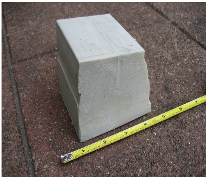
Left: The lower portion of tank shell showing a wall thickness of 3-1/2". Thicknesses can vary depending on the diameter, height, material used, and specific gravity of the application.